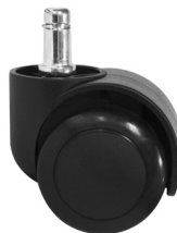
Weight release activates brake to prevent chair from moving when not in use. 2" dia.