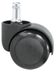
Premium hard floor caster. Hooded. 2" dia.