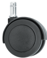
Premium hard floor caster. Hooded. 2.5" dia.